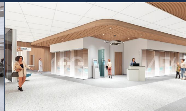
L1 Check-In & Registration