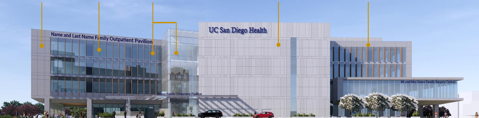
Top: East Elevation of OPP

Skin Designed to Optimize Energy Performance Vertical Fins Tuned to Sun Angle at East & West Horizontal Sunshades at South