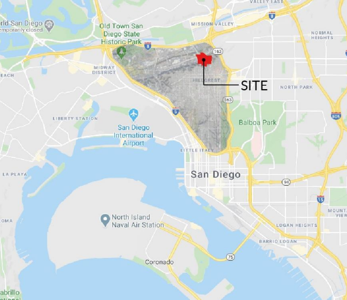
UCSD Hillcrest Site Location