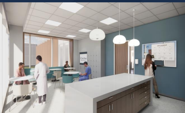
L3 Staff Lounge