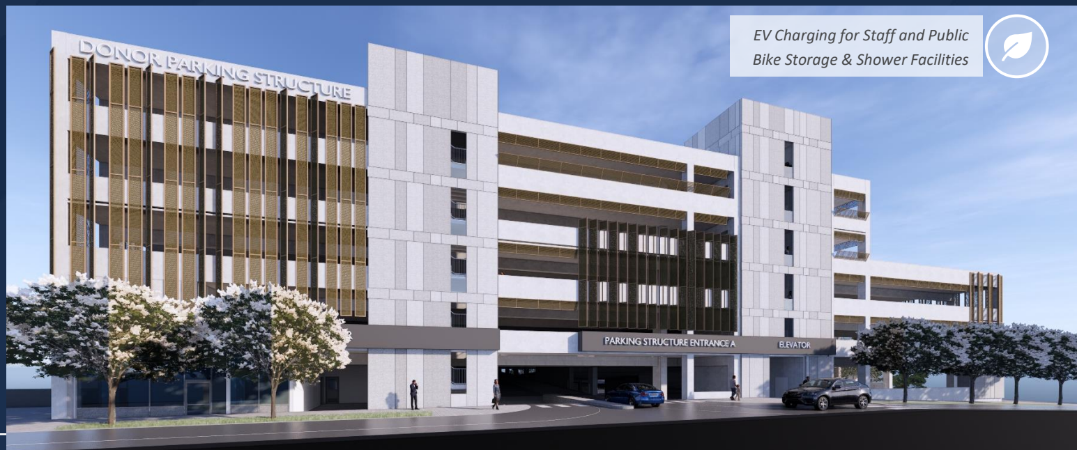
Right: Parking Structure West Elevation