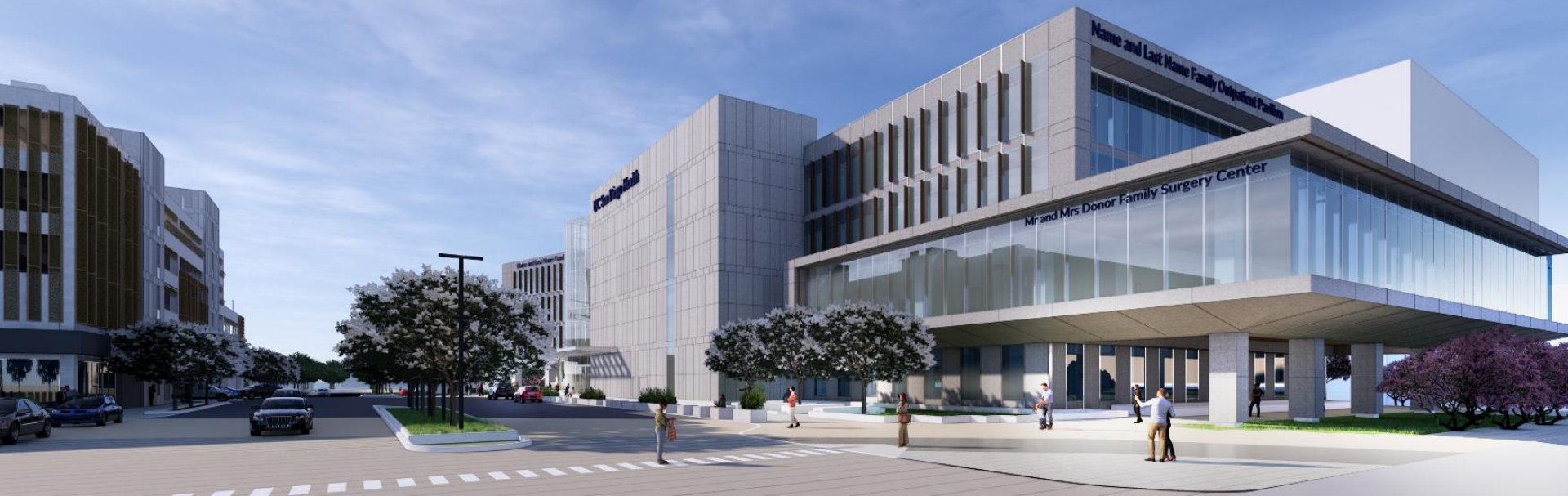
Top: View from future arrival court looking SW