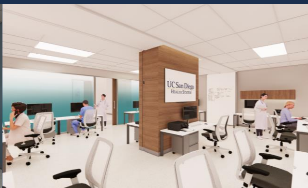
Typical Care Team Interior