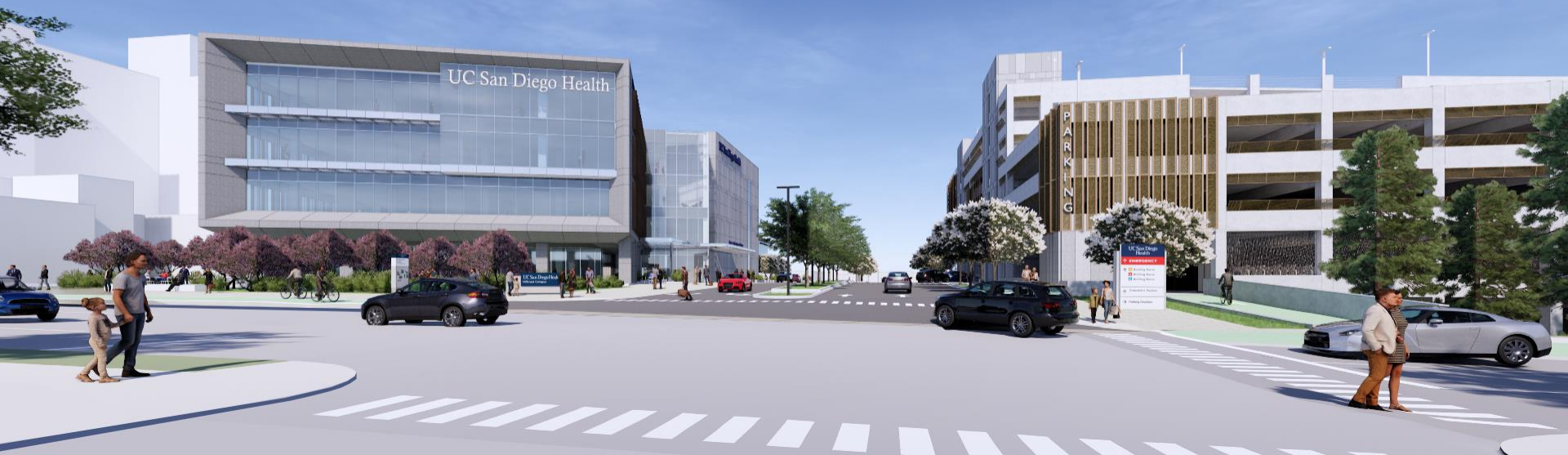
Top: Arrival at First and Arbor, looking northward to new Campus Gateway

Enhanced Commissioning Program Construction Waste Diversion Program