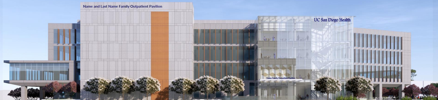
Right: West Elevation of OPP