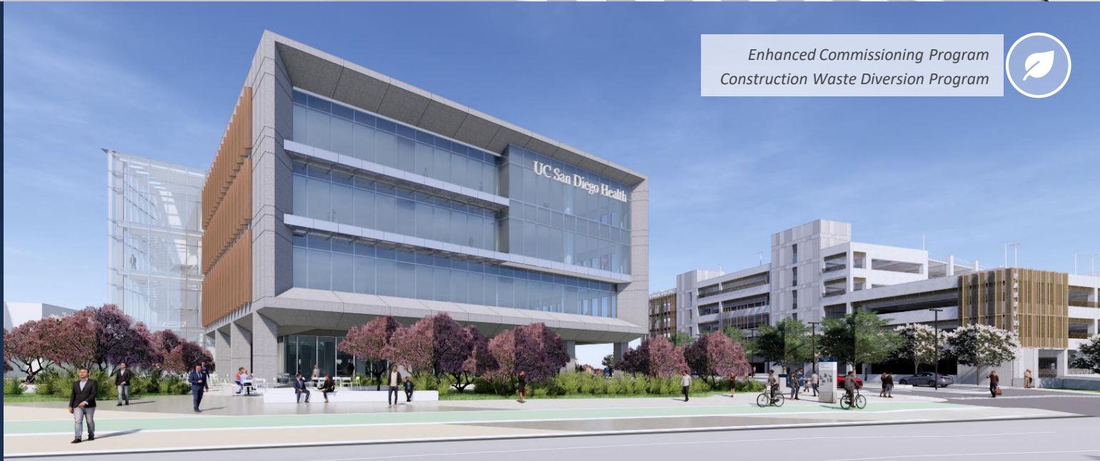
Right: Arrival from Front, looking NE towards Plaza