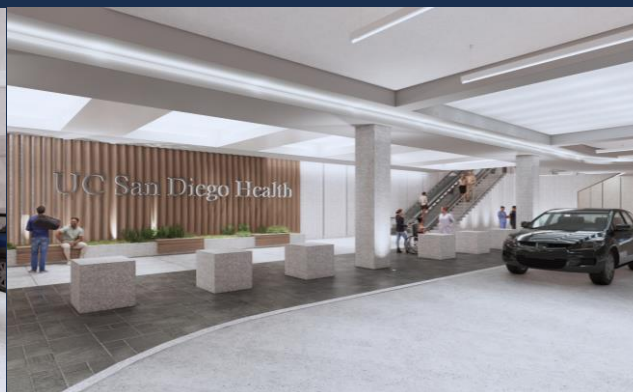
Lower Level Drop-Off Area