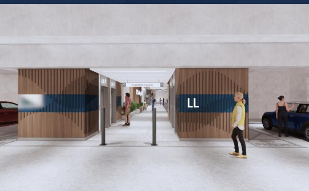
Lower Level Parking Structure Link