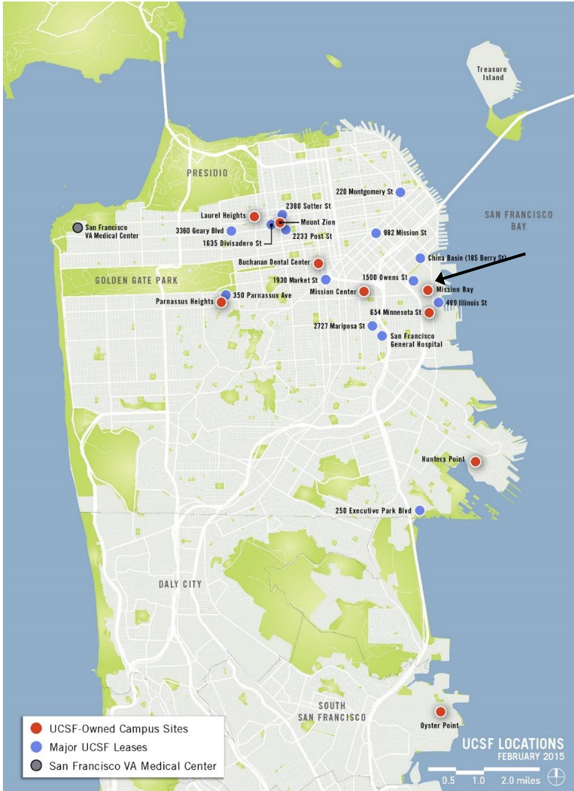
ATTACHMENT 4 Figure 1: Project Location