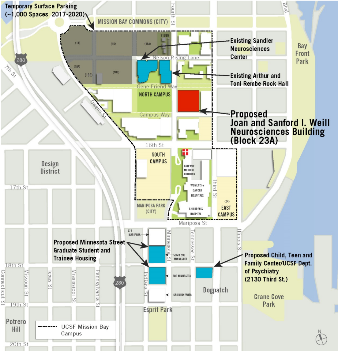
Figure 1: Project Site Location