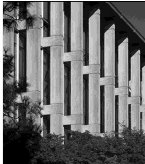
Figure 3. Beam connections at eccentric exterior columns prone to collapse.