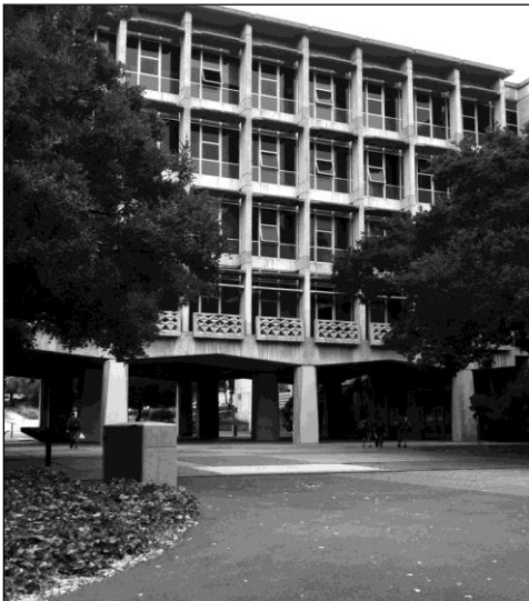
Figure 2. Open breezeway through central section of building.

Tolman Hall is by far the campus' most urgent priority for seismic remediation, partly because of Tolman Hall's unique structural characteristics – including an open ground floor breezeway under the central section (Figure 2) and perimeter columns and column-beam connections external to the building (Figure 3) – as well as its large size and population.