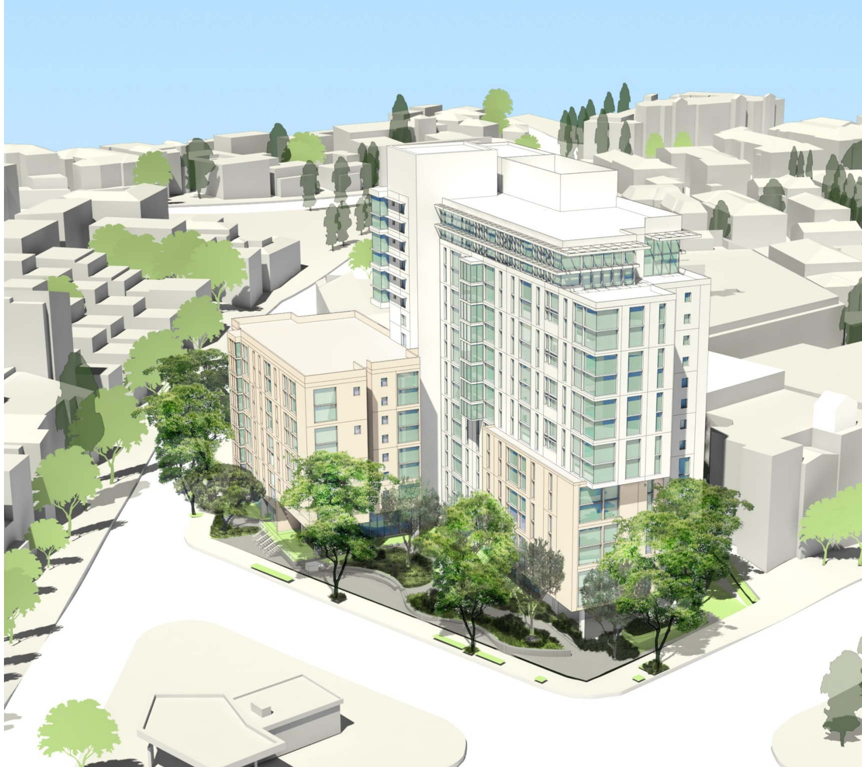
Aerial View Looking Northwest